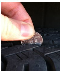
Use a quarter to check tire trends

Winter driving is a fact of life in Siouxland. The snow and ice can present even the most seasoned driver with challenges but being prepared can make getting around a little easier.